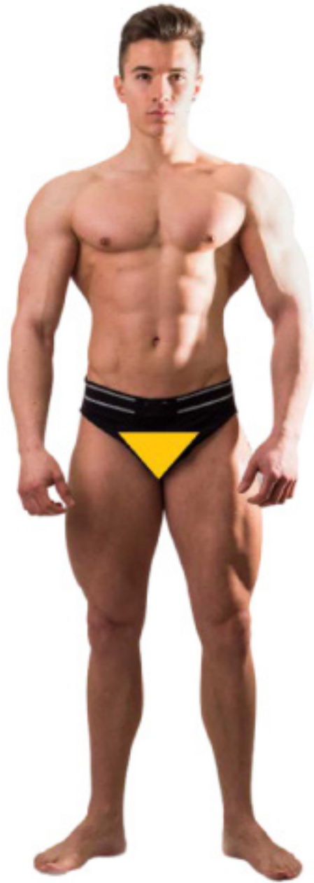
Jockey - Covers entire pubic area from front to back. Includes the shaft, scrotum, and thong line.