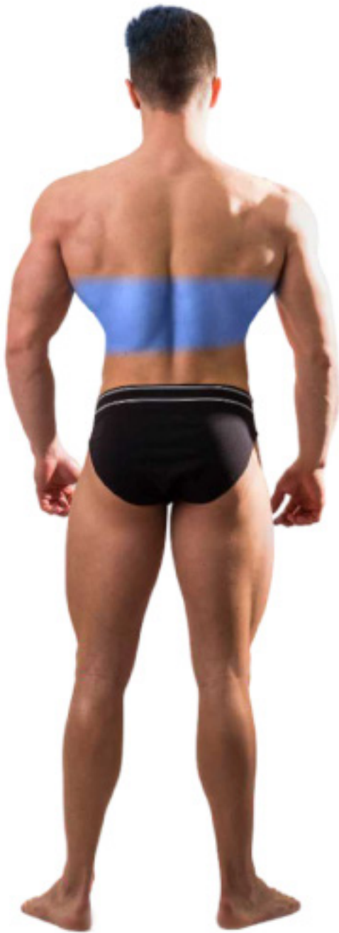
Middle Back - Covers 5 inches below the shoulder blades.