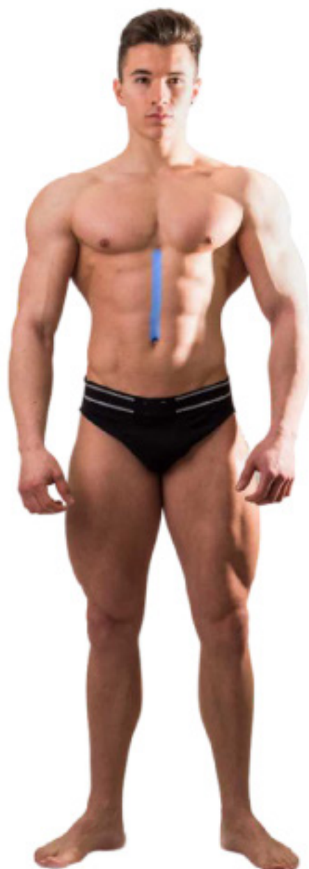
Upper Ab-Line - Covers 2 inches of mid abdomen line beginning bottom of sternum to top of naval.