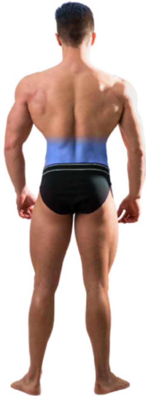
Lower Back - Covers 5 inches above last vertebrae.