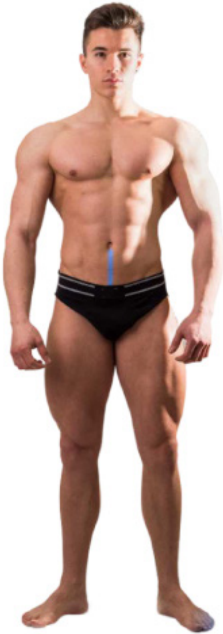
Lower Ab-Line - Covers 2 inches of mid abdomen line beginning at naval to top of jockey line