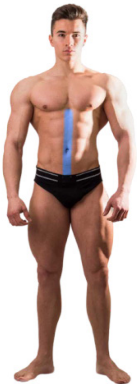
Full Ab Line - Covers 2 inches of mid abdomen line beginning bottom of sternum to top of bikini line.