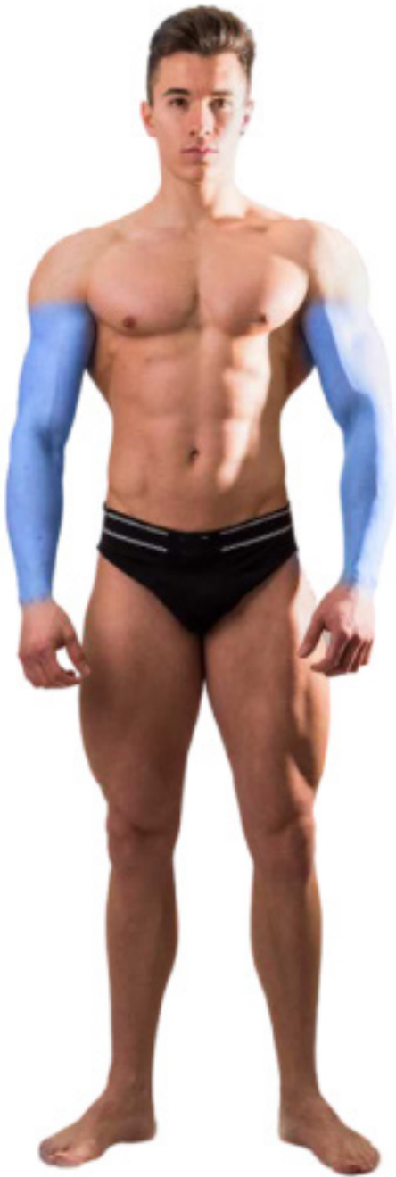
Full Arms - Covers from shoulder to wrist.