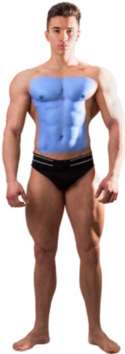
Chest & Abs - Chest and Abdomen covers from clavicle bone to top of jockey line.