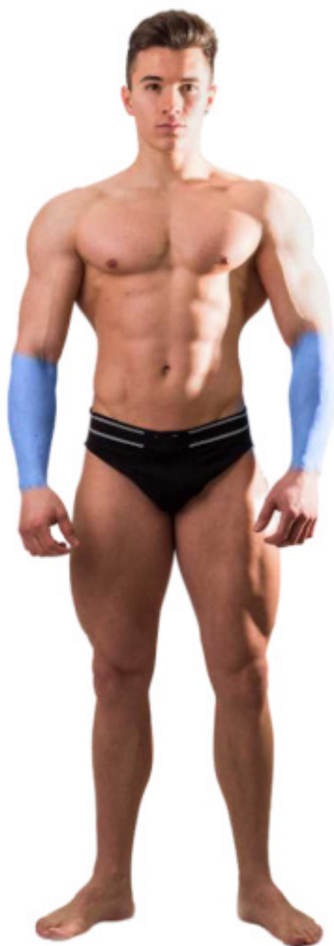
Forearms - Covers from mid elbow to wrist.