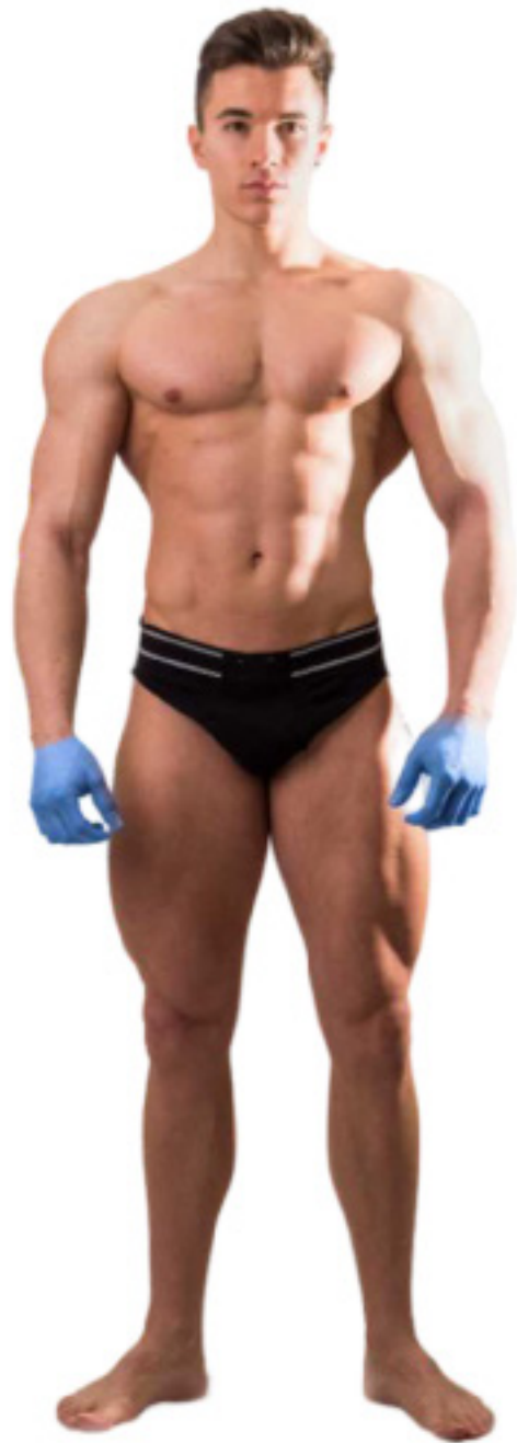
Hands - Covers from wrists to base of nail beds.