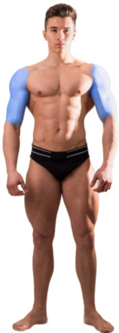
Upper Arms - Covers from shoulder to mid elbow.