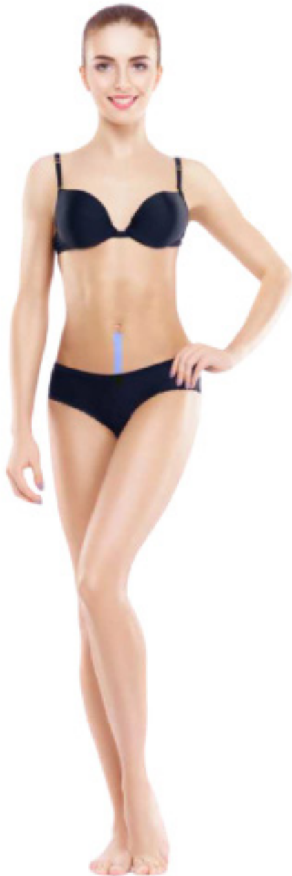
Lower Ab-line -Covers 2 inches of mid abdomen line beginning at naval to top of bikini line.