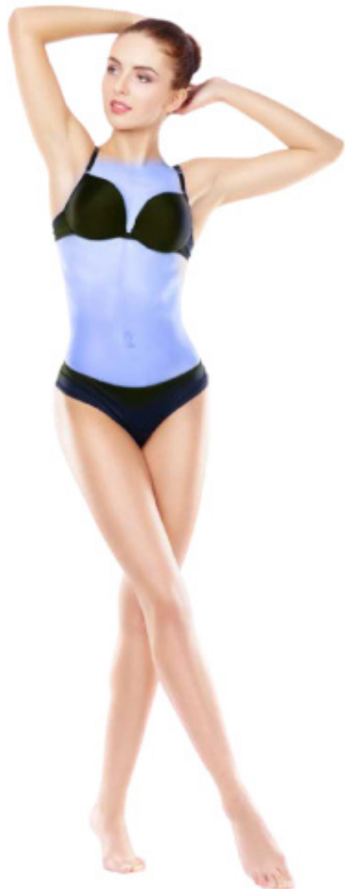
Chest & Abs - Covers from clavicle bone to top of bikini line.