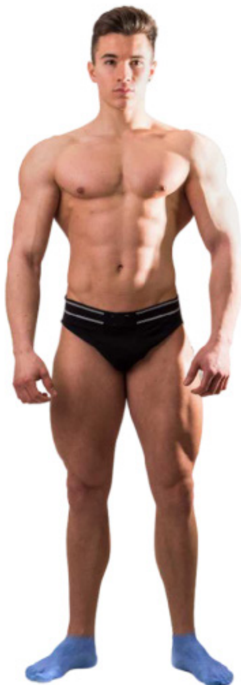
Feet - Feet and Toes covers from ankles to toes.